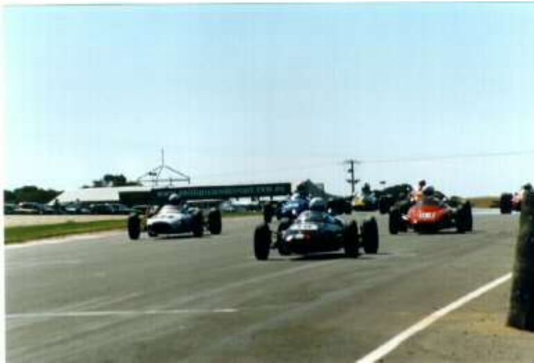
Start of FJ Race at Phillip Island on Sunday where everyone behaved themselves