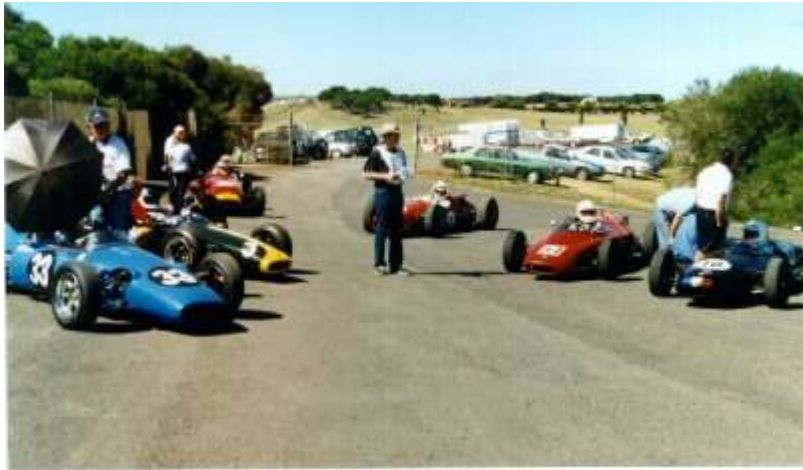
Cars lining up for Formula Junior Event at Phillip Island