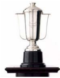
Leo Geoghegan Perpetual Trophy