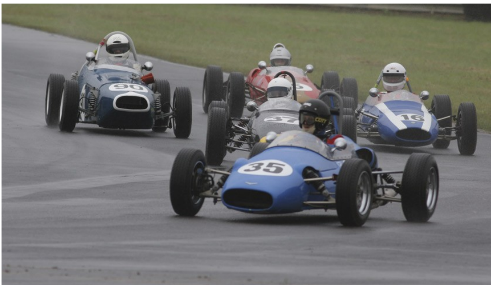
Formula Junior racing at Wakefield Park