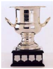
Aon Perpetual Trophy