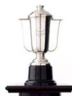
LeoGeoghegan FJ Trophy