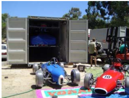
Cars being loaded into container in W.A. on route to N.Z.