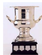
Aon Aussie FJ Trophy