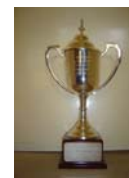
Nereo Dizane F3 Trophy