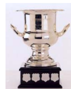
Aussie Car FJ Trophy